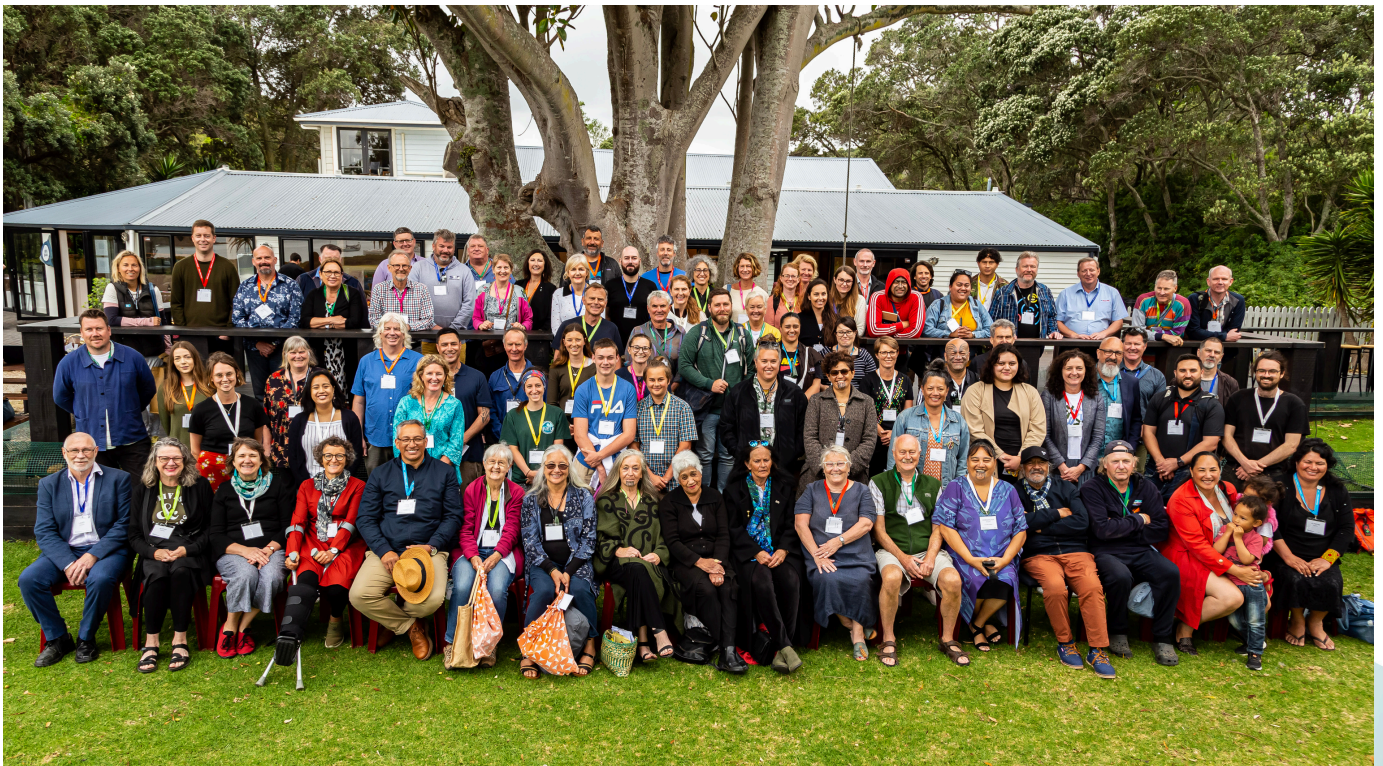
Image: Participants of the Waiheke Marine Project

In particular, the Pipi page of the WMP website gives details of the many hope-filled projects that are underway.