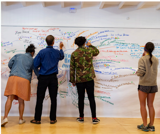
Image: Participants mind mapping

“It’s hard work being mana whenua. When you can feel the ihi and the wana rise, the power of positive collaboration and respect for one another start to flicker in the most distant minds, then it is worth it. We are bringing our whole(some) selves into relationship with place, culture and one another.”